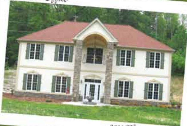
2484 Memorial Highway

Our full-service real estate company offers: