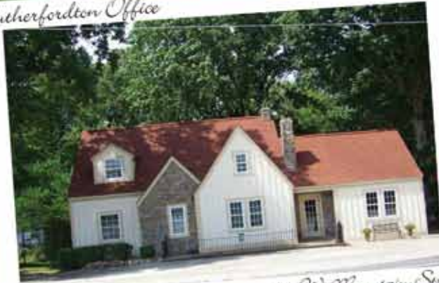
282 W. Mountain Street